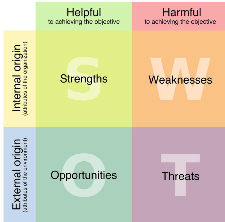
Fig. 4 SWOT analysis graphic

questionnaire, the institutions stated that the main reasons for applying for ETAP 2.0 certification were to audit their training programme and identify areas of improvement. They also said that they found the certification process objective, transparent, and concise.