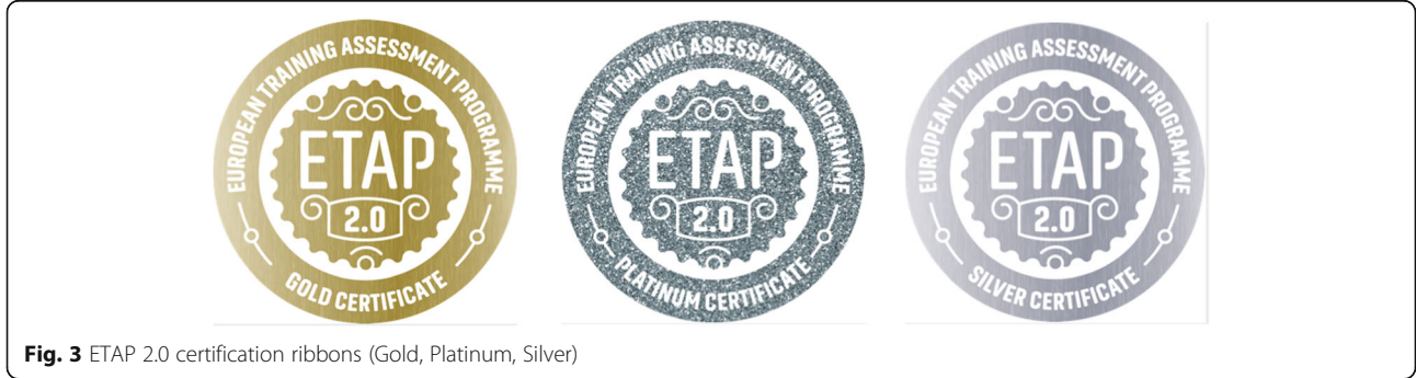
Fig. 3 ETAP 2.0 certification ribbons (Gold, Platinum, Silver)

The assessed institutions had to fill in a feedback form immediately after the assessment. In response to this