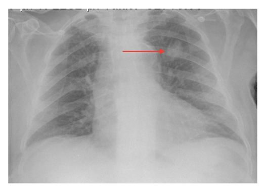
Fig. 2 Left upper lobe lung carcinoma ( arrow ), not reported on CXR (under-reading error)

Technical factors, such as the specific imaging protocol used, the use of appropriate contrast or patient bodily habitus may