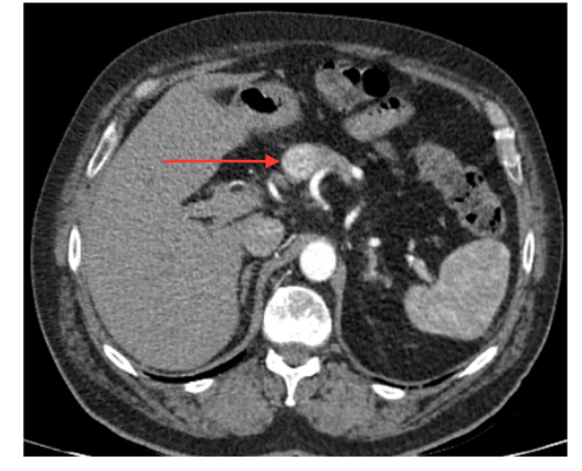
Fig. 3 Hypervascular pancreatic metastasis from renal cell carcinoma ( arrow ), not reported on CT; lung and mediastinal nodal metastases identified and reported (satisfaction of search error)

Possible system issues leading to error may involve staff shortages and/or excess workload, staff inexperience, inadequate equipment, a less than optimal reporting environment (e.g. poor lighting conditions) or inattention due to constant repetition of similar tasks. Unavailability of previous studies for comparison was a more common contributor in the pre-PACS [picture archiving and communication system] era, but should not be a significant factor in the current digital age.